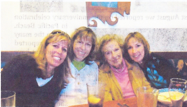
MOM AND SINGING SISTERS